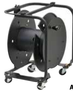
AVD-3 With optional casters