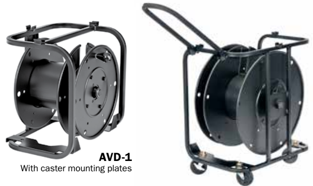
AVD-1 With castor mounting plates